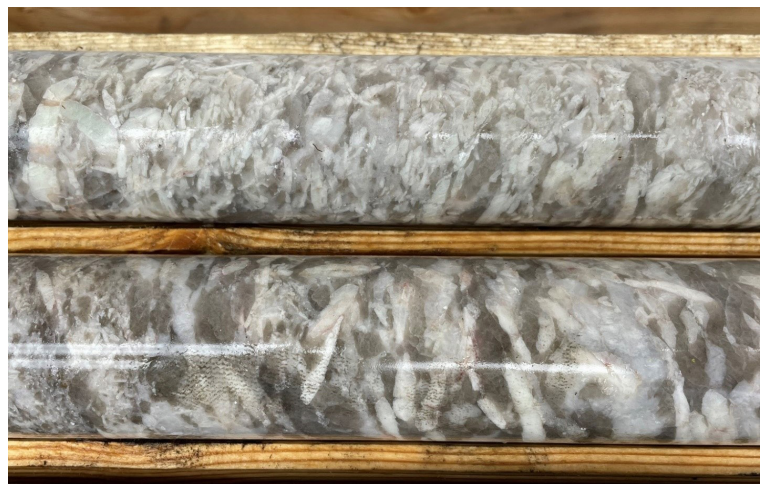
Killick Dyke: GH-22-26