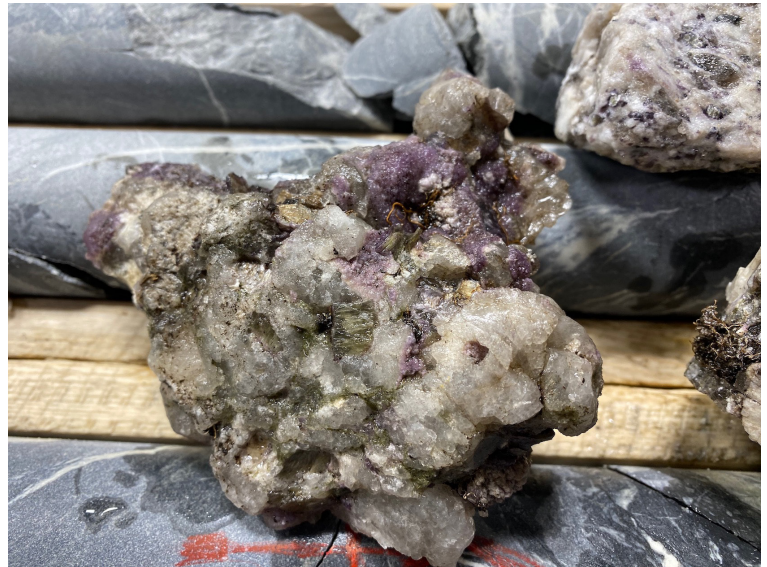
Hydra Dyke: 0.40 m @ 13.57% Cs 2 O, 0.316% Li 2 O, 0.012% Ta 2 O 5 and 0.38% Rb 2 O